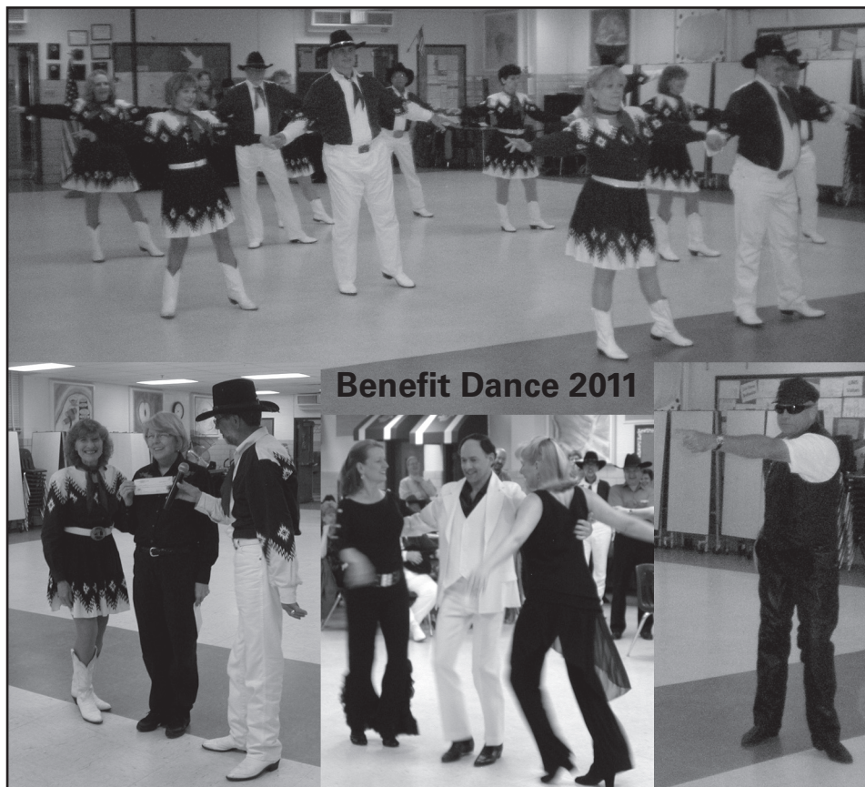
Benefit Dance 2011

More people have been attending our dances and joining the NVCWDA, so your Board has been looking for a place to dance that has the space of Luther Jackson Middle School and the temperature control of AUUC. If you