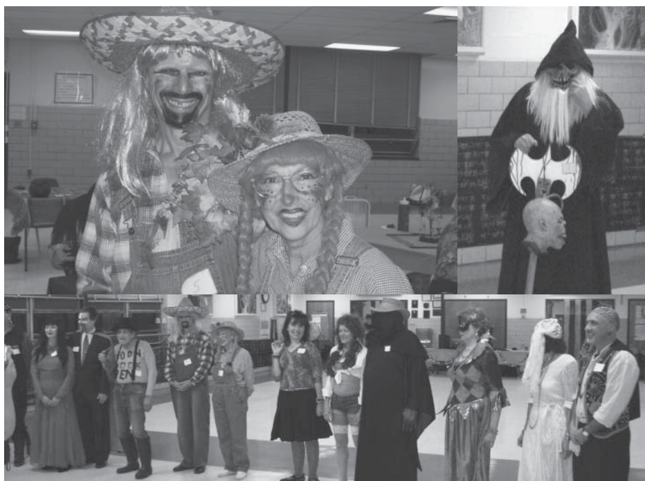
Halloween Dance 2009

In 2009 your Association participated in two community activities. You donated $2,340 to the